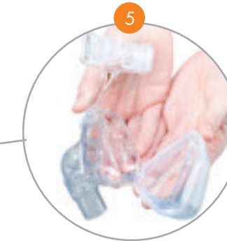
Dismantling and cleaning

6 Air vent is designed to direct a laminar flow downwards to maximize quietness during the night.